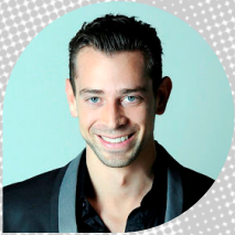
Gilan Gork Body Language and what the Spoken word is NOT telling you!